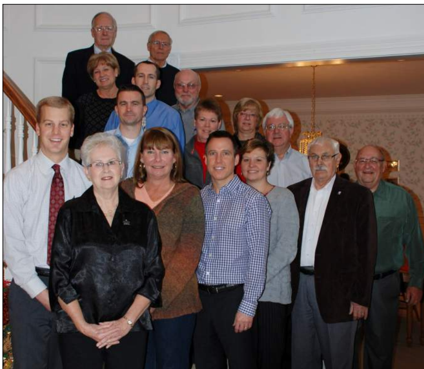
Noble County Community Foundation Board of Directors December 2014 Board Meeting